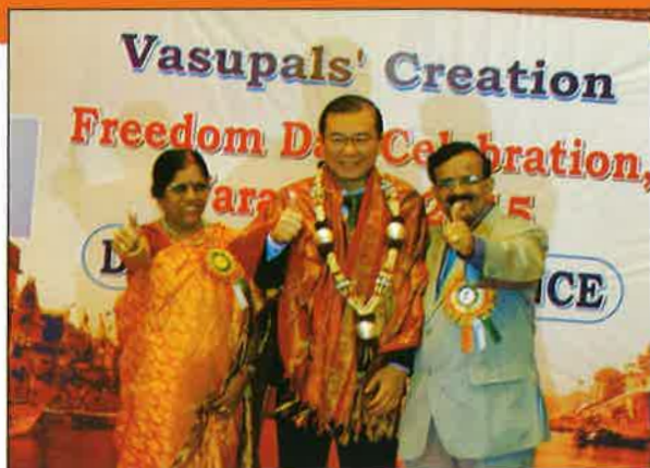
Freedom Day Celebration at Varanasi (See Page 16, Centerpage)